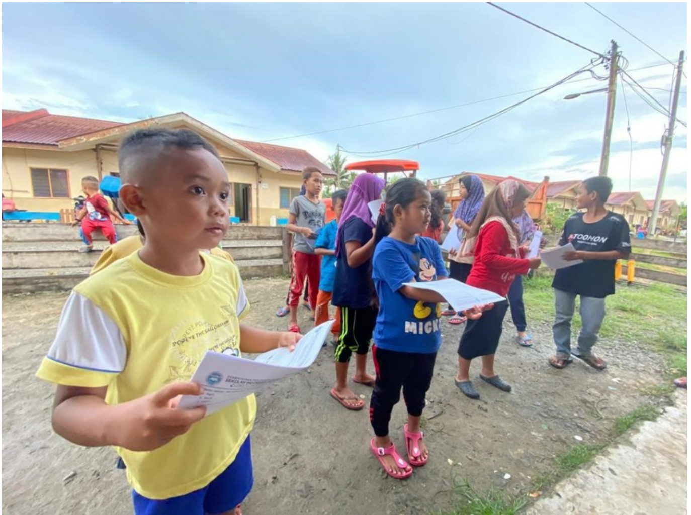
FGV's CLC students receiving exam papers delivered to Kampung Cenderawasih, in Sahabat Sabah