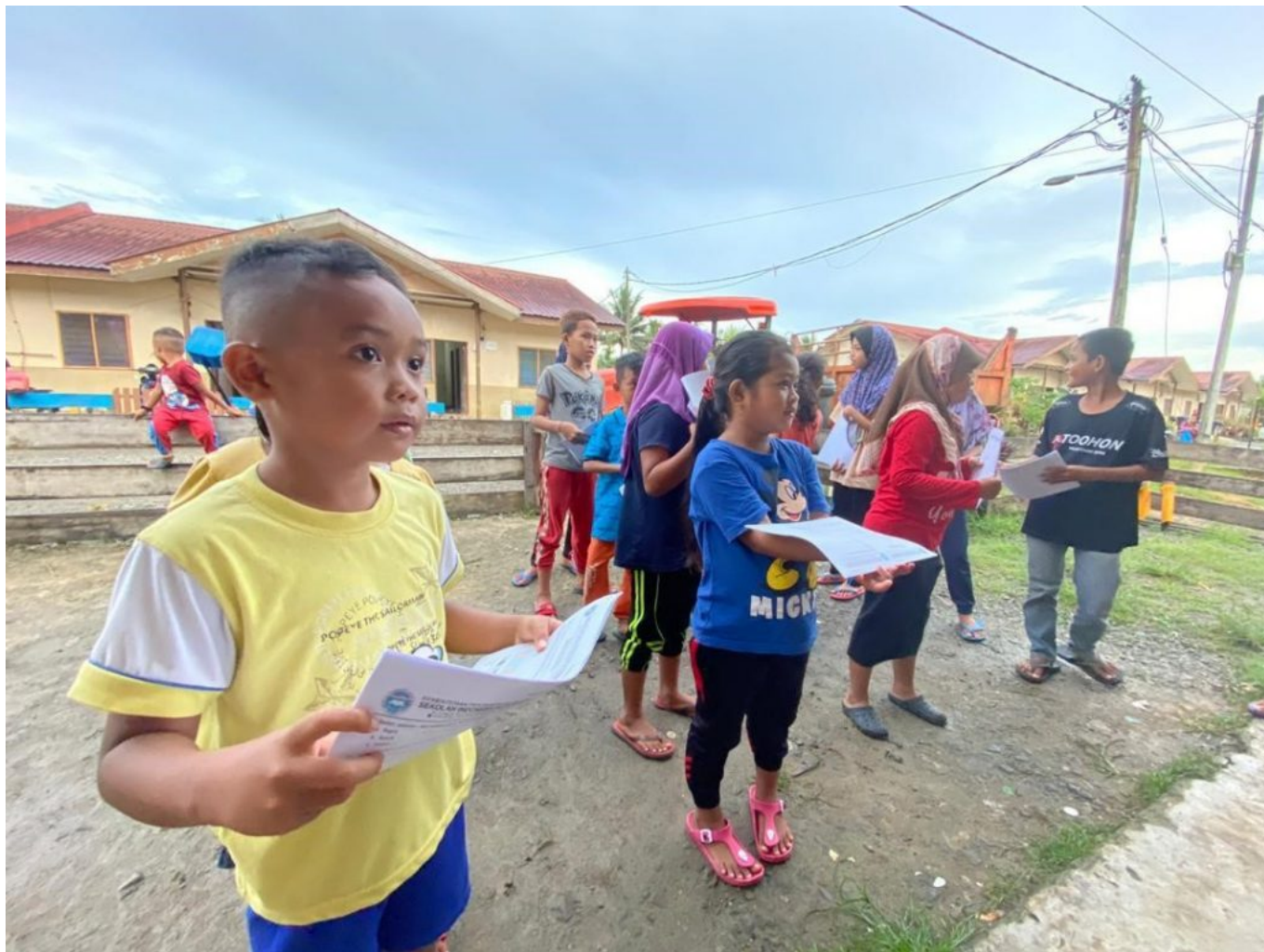
FGV's CLC students receiving exam papers delivered to Kampung Cenderawasih, in Sahabat Sabah