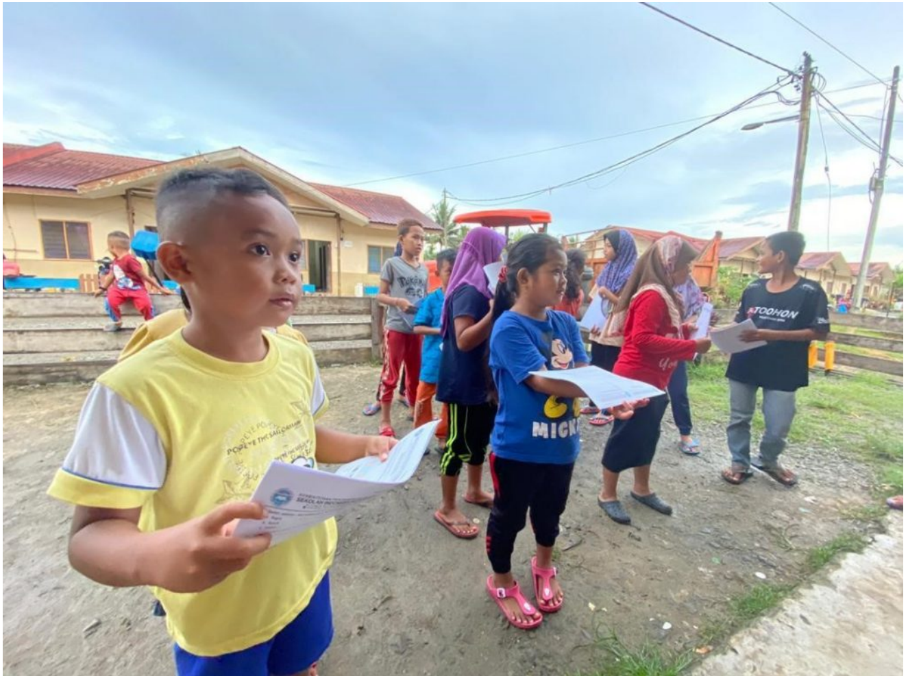
ing exam papers delivered to Kampung Cenderawasih, in Sahabat Sabah