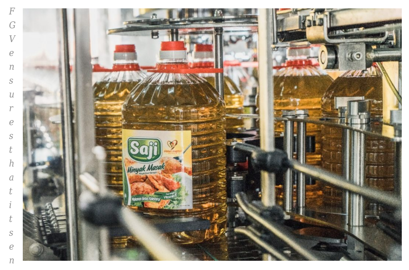
d-to-end food supply chain from raw materials to packaging and delivery will not be disrupted during the total lockdown phase

FGV has full integrated supply chains from farm to table, especially through palm-based products which help to ensure enough supply of oils and fats to the market. Through its Integrated Farming sector, FGV is embarking on new food segments such as cash crops, paddy as well as dairy to contribute to the nation's food security and reduce dependency on imported goods.